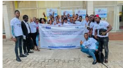
Figure 1: CENTAL Integrity Club members at Corina Hotel.

This is the second phase of the National Integrity Building and Anti-Corruption Program (NIBA), implemented by the Center for Transparency and Accountability in Liberia (CENTAL). The program builds and will draw from lessons learnt from the previous support. The overall aim of the program is to “Contribute to building and sustaining a Liberia where citizens act with transparency and integrity in all their dealings”; which will be reached by focusing both on increasing transparency and integrity of public sector institutions, but also by increasing citizens’ action in upholding integrity and transparency. There will also be a focus on continued capacity building of CENTAL.